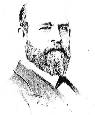
From The Henry George Movement to The Present

Sundays: November 28, 1982 December 5, 1982